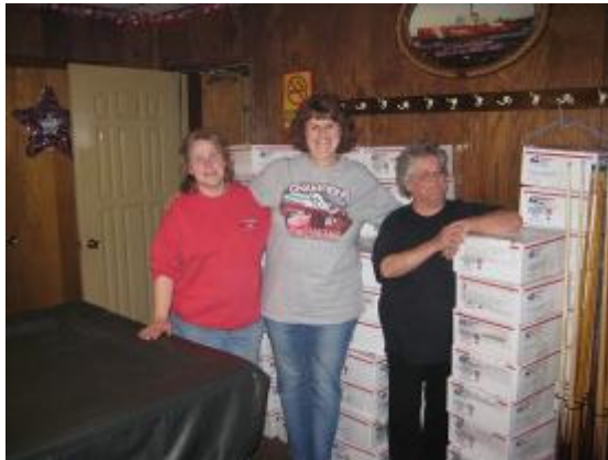
Some angels walk among us

Congrats to the Desert Angle project, and all those who participated